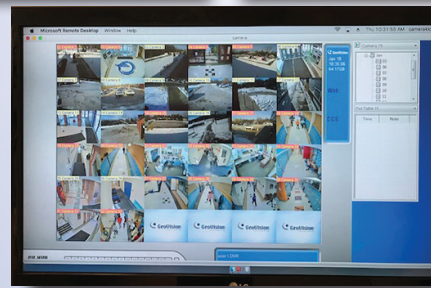
New security cameras and monitoring station