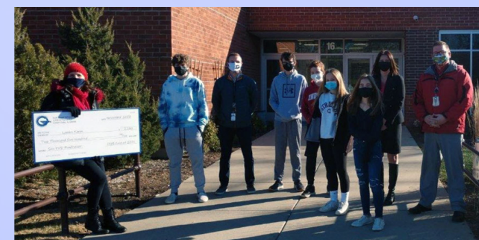
$2,500 donation to Lamb's Farm